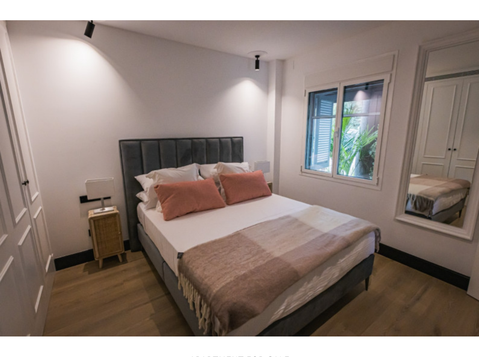
APARTMENT FOR SALE Puente Romano, Marbella Golden Mile